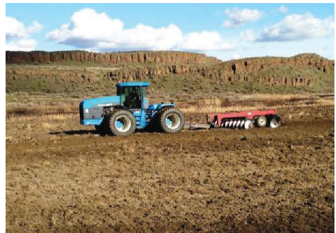
Equipment used in moist-soil marsh management.

Disking is the method of disturbing the soil surface and existing vegetation with a disk to prevent an area from going through succession to a woody condition. It is a preferred management method to retain and improve wildlife habitat on open land. Disking intensity refers to the disk depth and/or number of passes.