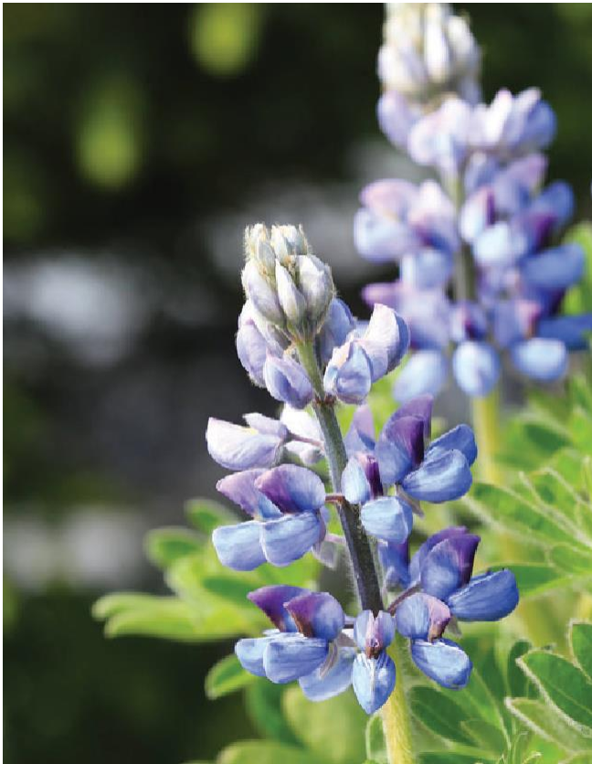
Wild lupine is one example of a compatible species that benefits from IVM. Several butterfly species use lupine as a host plant.

The order of the IVM process flowchart steps is interchangeable in some instances. As an example, managers may define program objectives at a broad, high level and then identify specific locations best suited to achieve each objective after the fact. Alternatively, initial systemwide inventories may produce a list of primary and secondary management objectives based on the inventory process. Both process flows have merit.