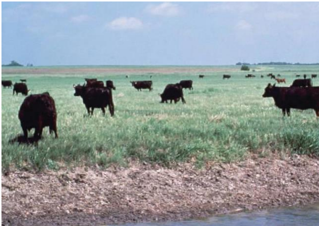
Grazing (other uses for wetlands).

The managed rotation of semi-feral or domesticated livestock can be used to maintain, enhance, or control vegetation. A proper grazing prescription can promote structural and biological diversity. Prescriptions should be species specific and developed with an understanding of plant life cycles and grazing response of the selected vegetation. Care must be taken to minimize the possibility of overgrazing, erosion, and water contamination. The variables of herbivore selection, seasonal timing, and intensity must be considered to ensure site objectives are met. Contracting with commercial grazers can be helpful in determining suitable livestock and best timing for specific outcomes. Results should be monitored to inform future management decisions.