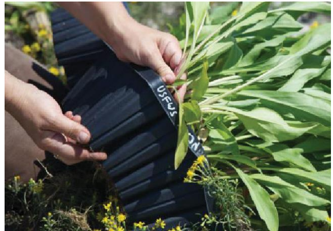
Seaside goldenrod at Monomoy NWR.