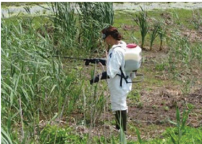
Spraying invasive phragmites.

Also referred to as chemical control methods, these management practices are described in detail in the IVM BMP, 3rd edition. While using chemical methods, a vegetation manager should prevent pest plant buildup; scout for pollinator habitat (nest sites, flowers, etc.) and protect those areas; choose alternative active ingredients, formulations, or application methods to reduce damage to compatible vegetation; and adjust timing to avoid periods when pollinators (including bees) and other wildlife most likely are present.