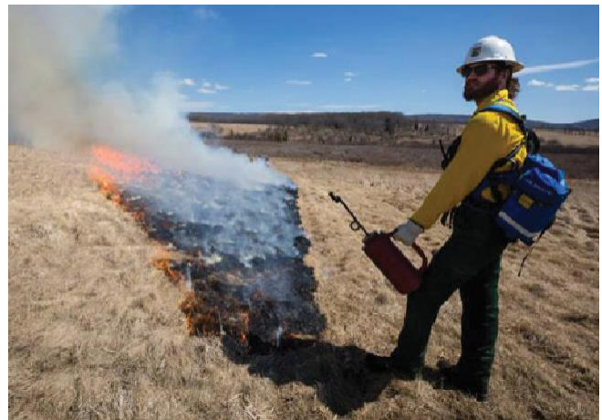
Firefighter standing guard over fire.

For more information on prescribed burns, see USFWS management guidance ( Management Methods: Prescribed Burning ) and NRCS information ( Prescribed Burning ).