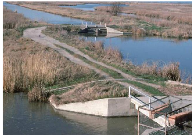
Water-control structure, Bear River NWR.

By alternating the water level throughout the season or rotationally flooding areas over time, different wet-loving vegetation can be encouraged and nutrients can be recycled to improve vigor. This BMP is best suited to existing wetlands or wet depression areas, in active or fallow fields, or in some meadow situations. Water-level management can be a very cost-effective BMP.