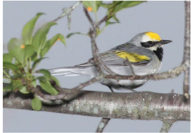
Golden-winged warbler.

Utility in developing a scope of work to pursue their stewardship goals.