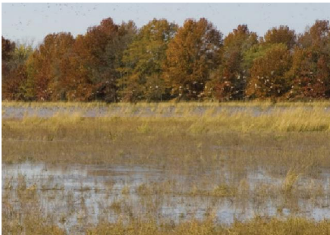
Ducks taking flight over a managed wetland.

After the baseline was determined, the vegetation manager developed management goals and objectives to enhance the quality of the wetland. The primary goal was set to achieve a minimum VIBI score of 45 (Category 2) and a maximum invasive cover of 10 percent. Achieving a minimum score of 45 would indicate a greater abundance and diversity of native vegetation present at the mitigation site. To assist in achieving this goal, the manager partnered with the local USDA-NRCS and Ducks Unlimited to obtain technical assistance material and guidance.